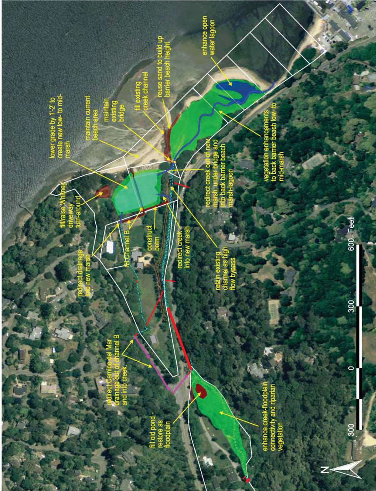
FIGURE 7 - 3